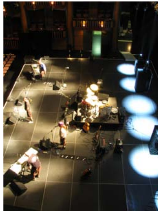
Arena Stage View From USL Spot Position

Check with CCPA Electrics department regarding availability of moving light package