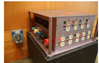
Distro Box w/ Pin & Sleeve plug